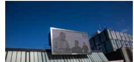
Our video on Town Centre TV