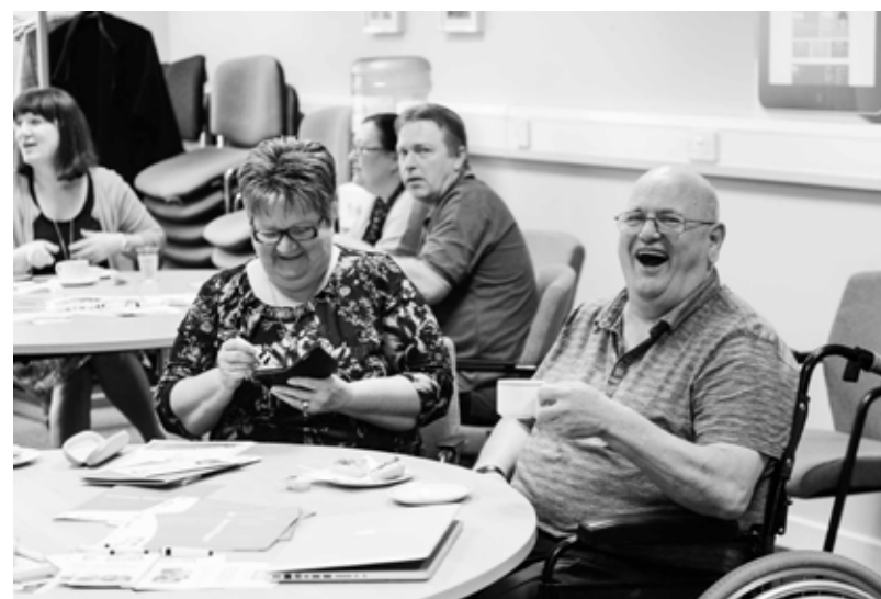
Website launch day