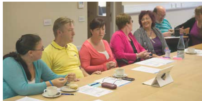
Some members of our Focus Group

Thanks to the Board for all the support they have given the Development Team over the last year.