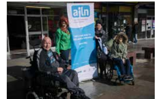
SDS Awareness week