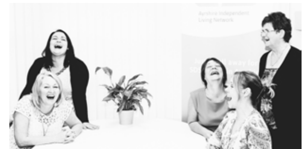
Finance & Payroll Team

232 employers use our SDS Payroll & Budget Management Service and we run a four weekly payroll for 507 personal assistants. Figures taken October 14.