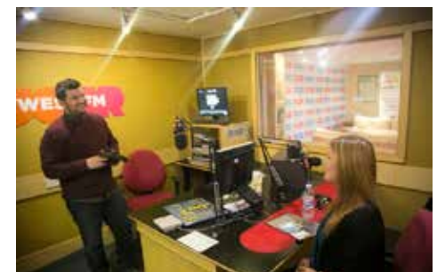
Jen promoting SDS on West FM